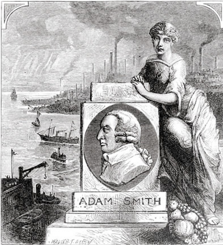
A woodcut from the 19th century depicts Adam Smith and the Industrial Revolution.