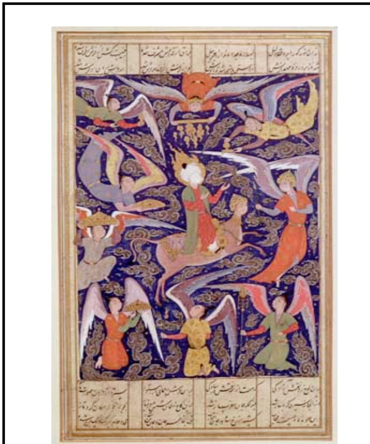
“The Ascension of the Prophet Muhammad”

A 16 th century Persian manuscript of the Islamic school. Manuscript shows Muhammad ascending into heaven surrounded by angels; out of respect, his face is veiled.