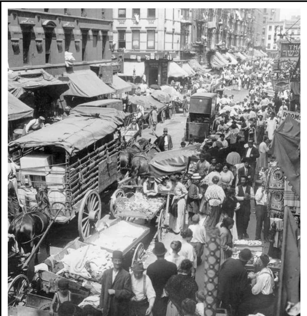
New York City circa 1900-1909