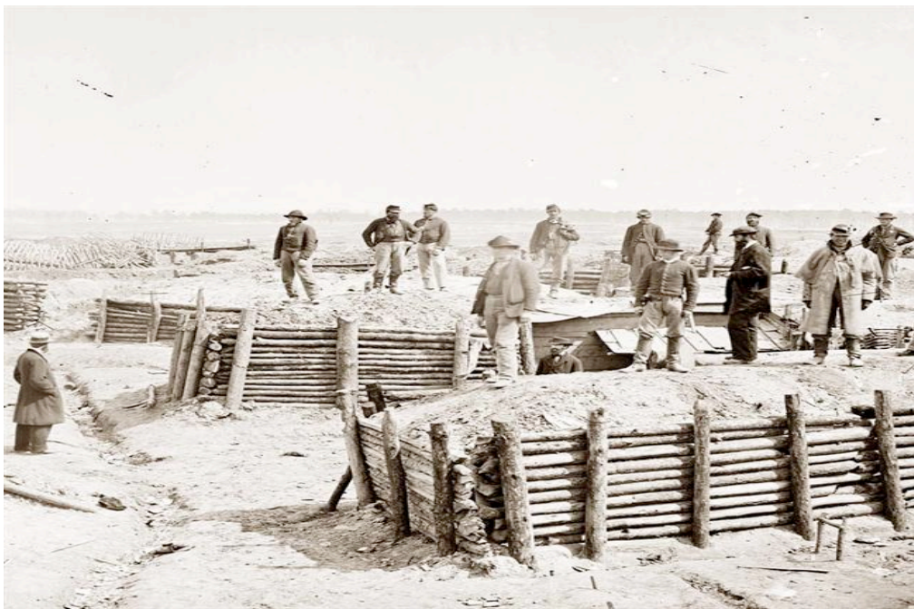
Petersburg, Virginia Breastworks of the Confederate Fort Mahone, 1864