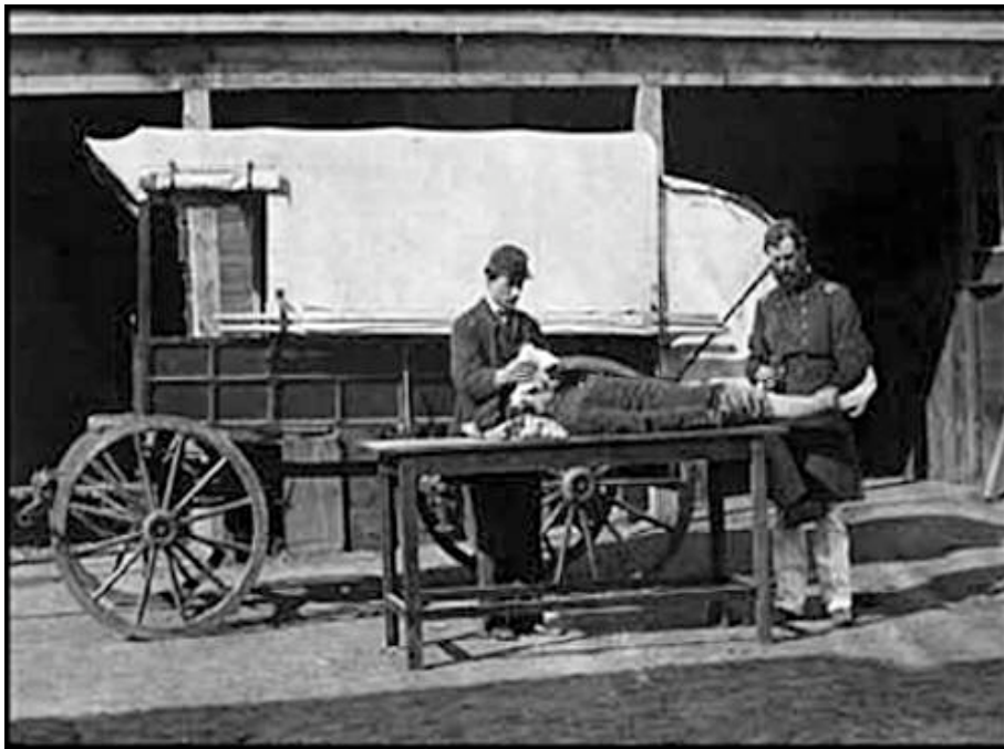
The military surgeon appears ready to perform a below the knee amputation of the right leg while the anesthetist (with a hat) applies an anesthetic sponge to the face. National Museum of Health and Medicine, Washington, D.C. 1864.