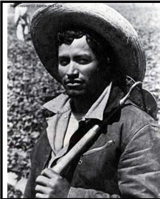
A bracero sugar beet worker in the fields of Idaho during World War II.