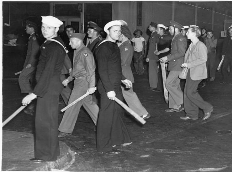
On the streets of Los Angeles, U.S. servicemen wield wooden clubs during a "zoot suit" riot, June 1943.