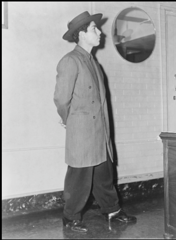
A young man wearing a zoot suit and hat, 11 June 1943.