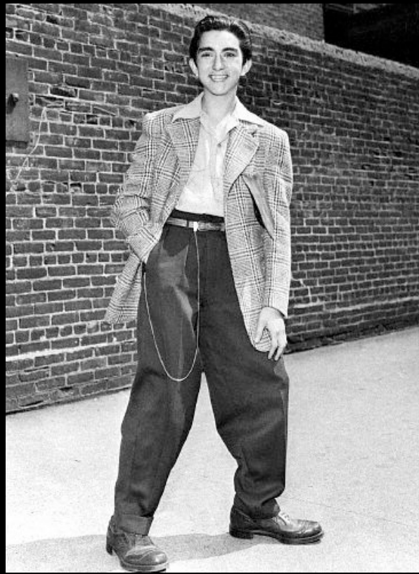
1943: ZOOT SUITS